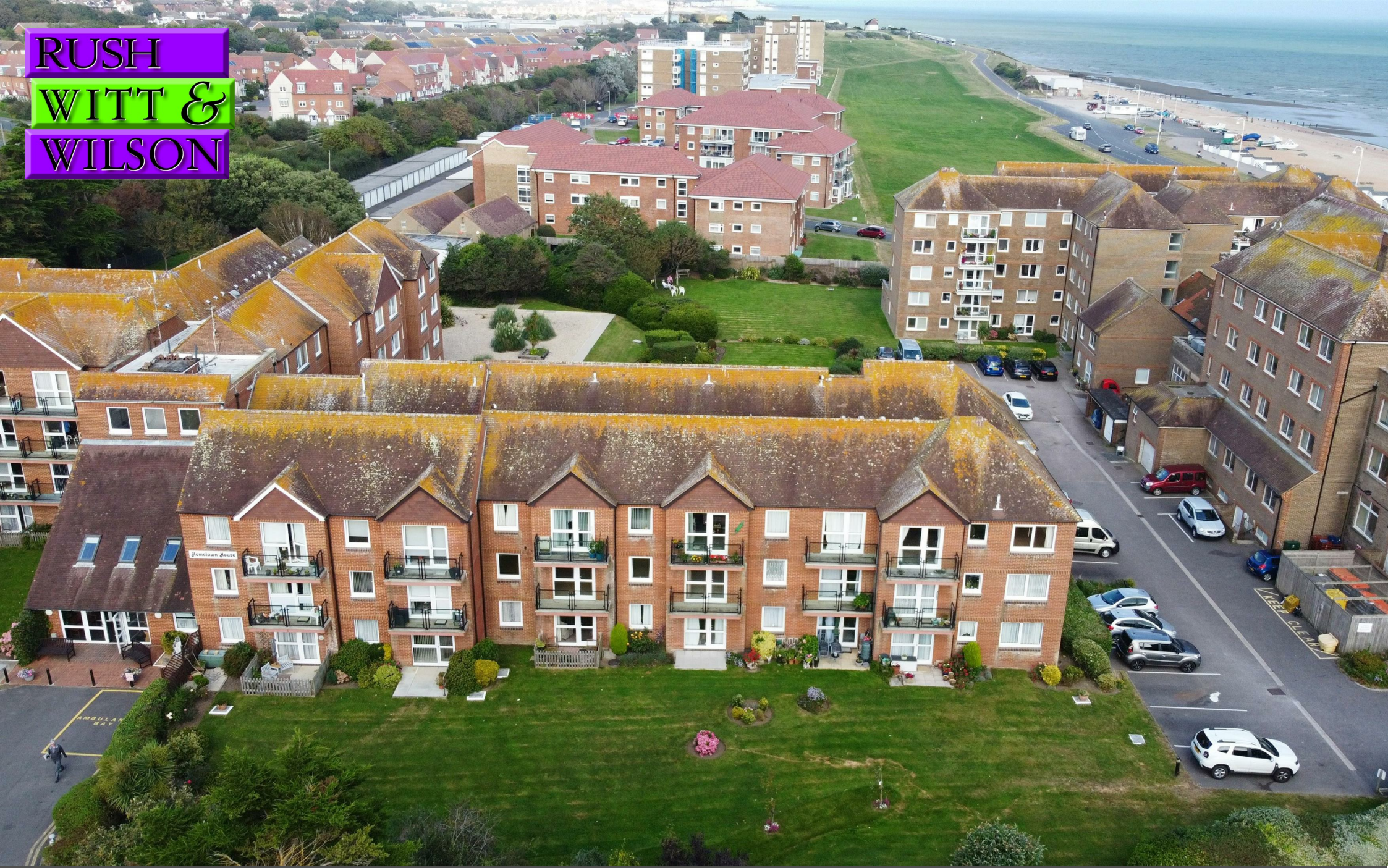
51 Homelawn House Brookfield Road, Bexhill-On-Sea, East Sussex TN40 1PN £129,000